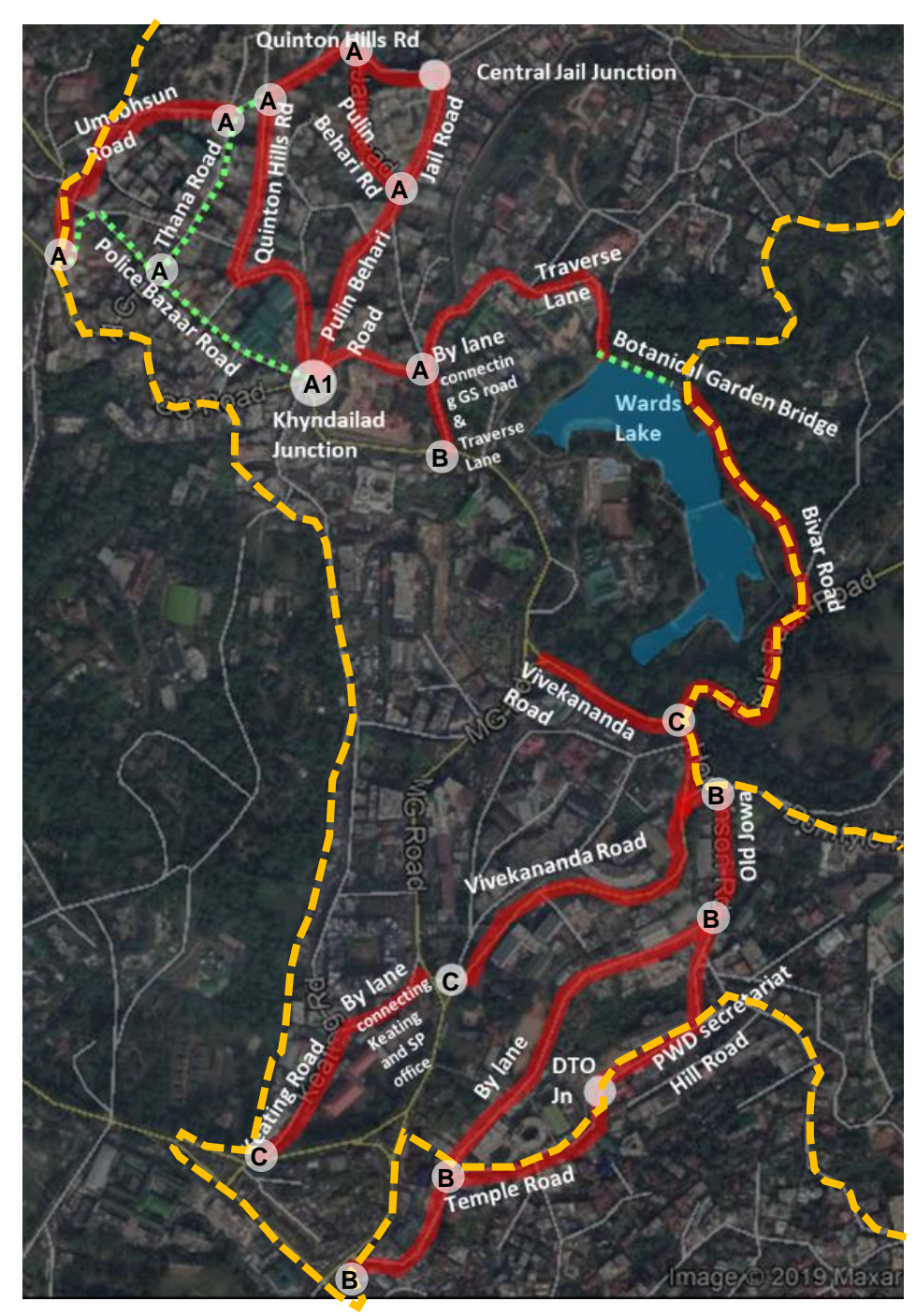
Figure 1-2:The figure showing identified smart road names